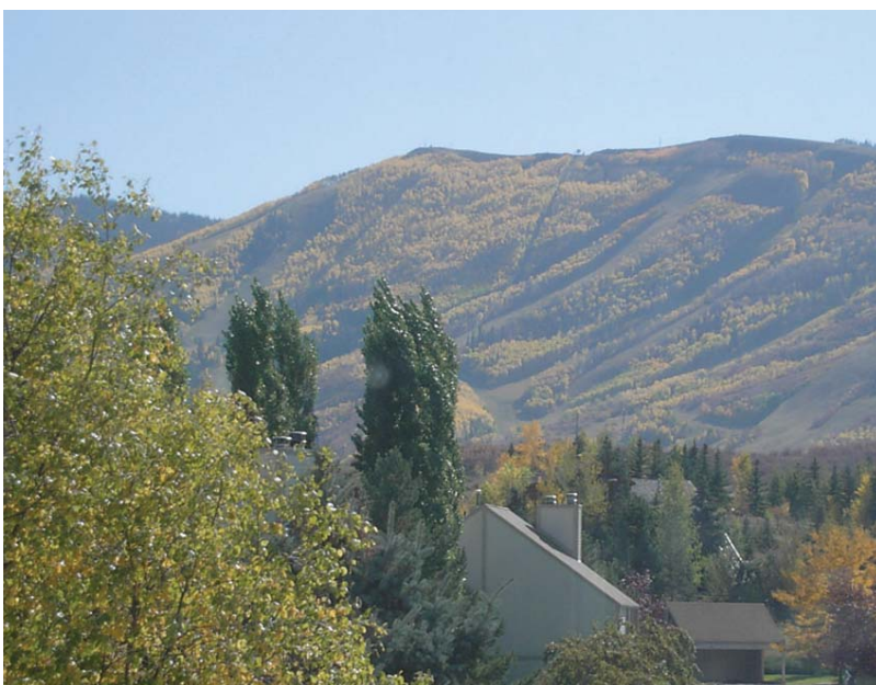
VIEW FROM LOFT