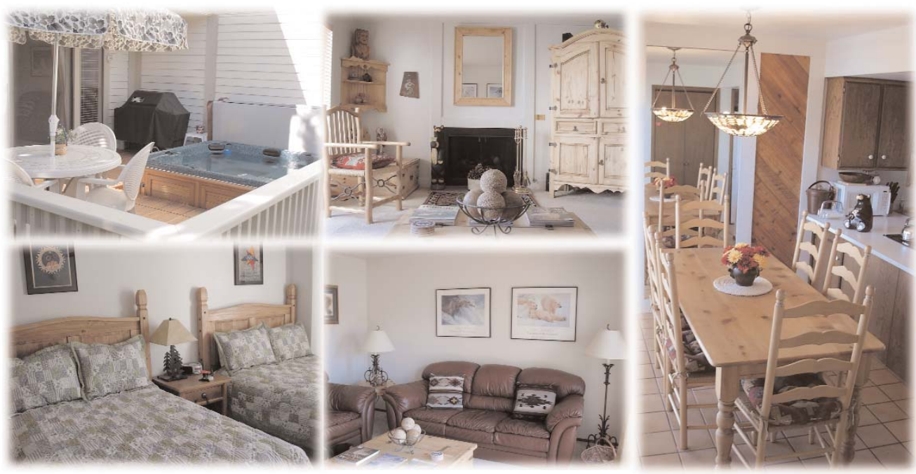
CLOCKWISE: Private Deck; Living Room; Kitchen; Loft; Living Room